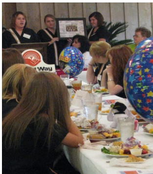
Students present an autograph picture to United Way, as a token of appreciation to them for the program.