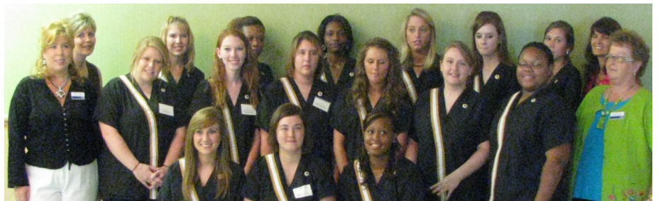
United Way Student Nursing Academy graduates.